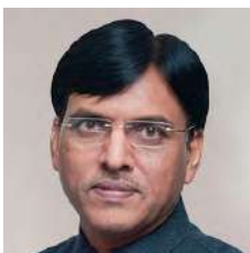
Dr Mansukh Mandaviya

Minister of Commerce and Industry, Government of India