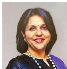
Dr Sangita Reddy

Joint Managing Director, Apollo Hospitals Group