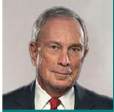
Michael R. Bloomberg

Founder, Bloomberg LP & Bloomberg Philanthropies