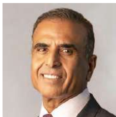
Sunil Bharti Mittal