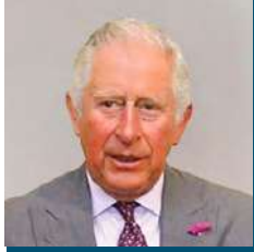
HRH The Prince of Wales