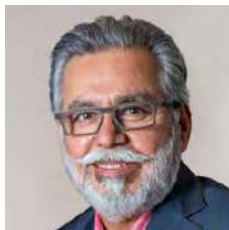
Dr Pawan Munjal