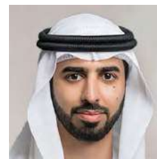
H.E. Omar bin Sultan Al Olama

Minister of Health and Family Welfare, Chemicals and Fertilizers, Government of India