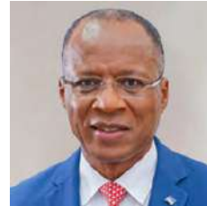
H.E. José Ulisses Correia e Silva

Minister of Foreign Affairs, Government of Republic of the Gambia