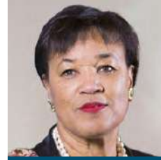
Baroness Patricia Scotland

Minister of Textiles & Minister of Women & Child Development, Government of India