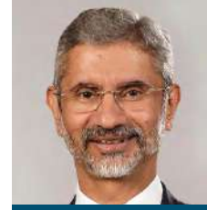
Dr S Jaishankar

Director-General, World Health Organization