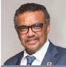
Dr Tedros Adhanom Ghebreyesus

Director-General, World Health Organization