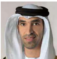
H.E. Dr Thani bin Ahmed Al Zeyoudi

Secretary of State for Foreign, Commonwealth and Development Affairs & Minister for Women & Equalities, Government of UK